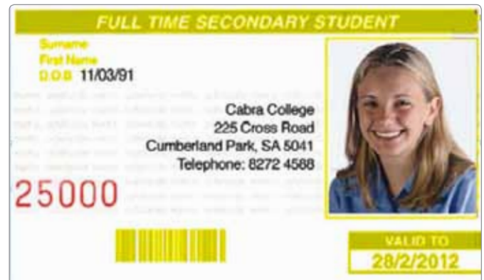
Full-time Secondary Student

Please present your card at time of check-in.