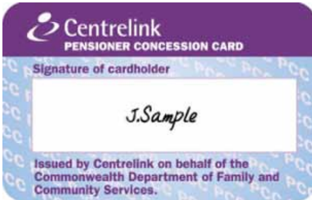
Pensioner Concession Card